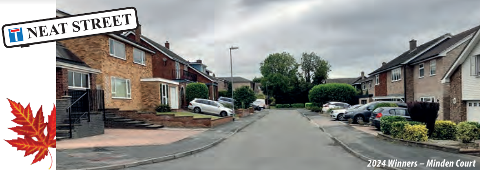
2024 Winners – Minden Court