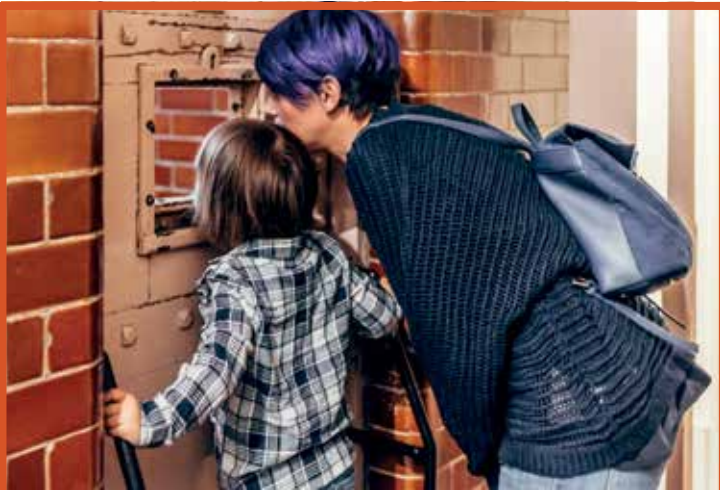
Discover our Edwardian police cells

Cambridge & District YOUTH FOR CHRIST cambridgeyc.uk/st-neots