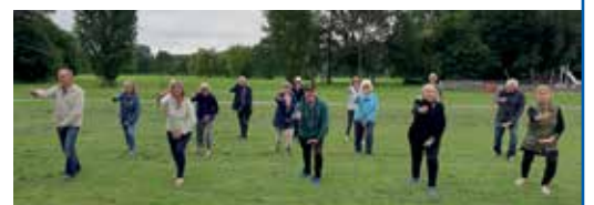
Tai Chi group